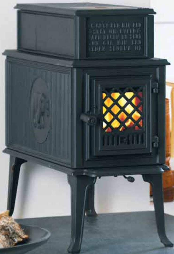
Jøtul F 118 CB Black Bear shown here in Classic Matte Black Paint