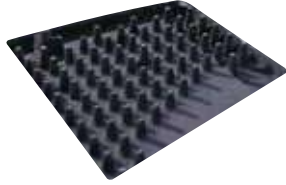
Jøtul Double "Heat Cleats™"

Why mess with success? Based on the widespread acceptance of its Red House Design gas stove cousin, the Jøtul GF 100 DV II Nordic QT, we now bring you the Jøtul F 100 Nordic QT. With its handsome decorative pattern based on the traditional Norwegian sweater, this small stove is the perfect space heater for cottages, camps & smaller living areas. This powerful stove continues our tradition of non-catalytic clean-burn wood burning design and innovation with the Jøtul Simplex™ clean burn technology that optimizes fire viewing area, fuel loading convenience and combustion efficiency. Popular options include: fresh air kit, leg leveler kit, long leg kit and a choice of two colors.