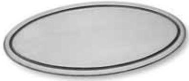
Jøtul F 500 optional cookplate

Choosing a large woodstove? This is one of our most popular models and a true performer. The Jøtul F 500 Oslo woodstove features both front and left side-loading convenience to go with its legendary non-catalytic clean burn combustion efficiency. With its signature Gothic arch design and large fire viewing area, the Jøtul F 500 Oslo is the best selling large non-catalytic cast iron woodstove in North America. Popular options include: screen for open door fire viewing, leg leveler kit, short leg kit for fireplace installations, mobile home approved leg bracket kit, outside air adapter, rear heat shields, blower kit and a choice of five enamel colors or Classic Matte Black Paint.