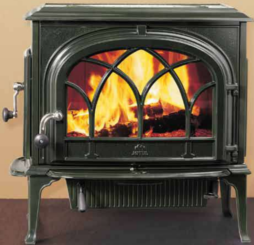
Jøtul F 500 Oslo shown here in Green Majolica Porcelain Enamel